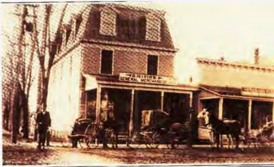
Photo is circa 1905. This picture is from a group of photos given to the Aberdeen Room Museum by Mrs. Jane B. Viele.

The Strasbaugh, Steckle and Hewitt Company's building stood next to the Odd Fellows building which was on the corner of Front Street (now Route 40) and West Bel Air Avenue. The building burnt to the ground in the February 5, 1918 fire which consumed many of the business district structures